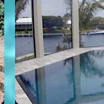
Color: Black Pearl