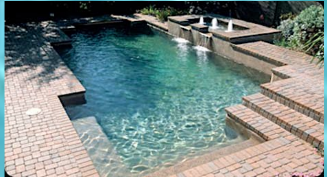
Color: Sedona Red