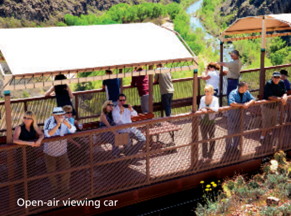
Open-air viewing car